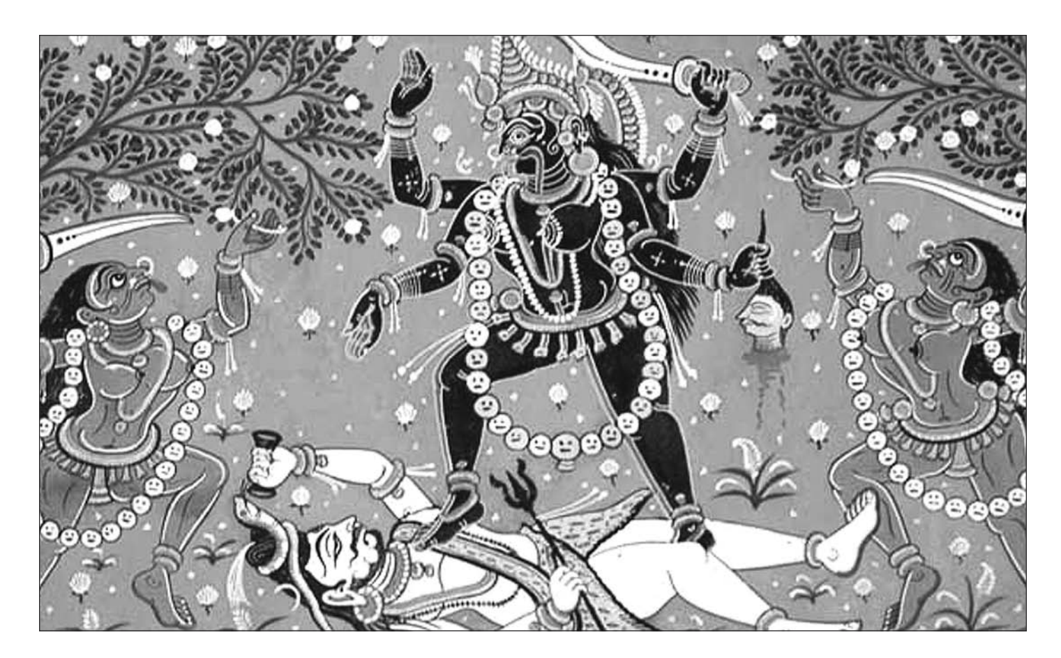
Kali, the black figure at the center of the picture above, is the mother of all other gods and goddesses, according to Hindu thinking. She is merciful and forgiving toward humans, whether one is good or evil, but is a powerful and frightening figure when she goes about to destroy evil demons like Shumb and Nishumb, as in this picture. Kali is "Shakti"—a sacred force embodied in a female form.

Shiva himself—one of the five primary "forms" of God in Hindu philosophy—is incomplete without her. In Hinduism, destruction is not automatically evil, especially when what is being destroyed is a barrier to spiritual progress. Kali wields weapons to destroy the demons of ignorance and illusion and wears a necklace of skulls to remind us that her true name is Time.