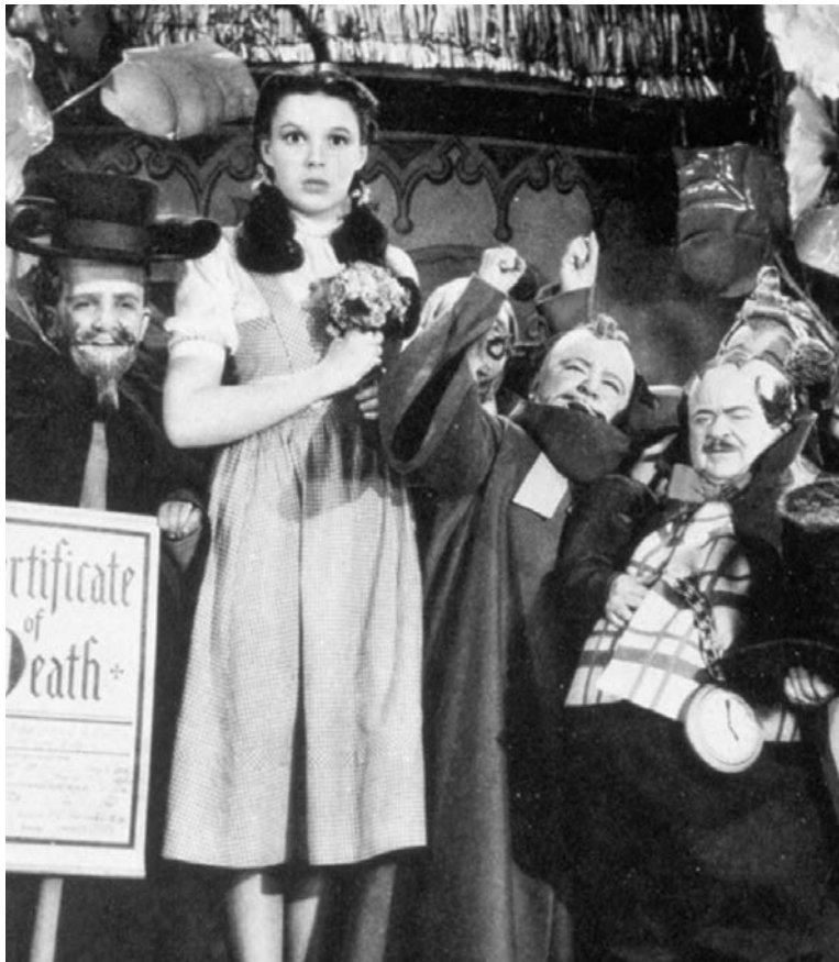
Did Baum intend the Munchkins to be a symbol of the American people? Above, Dorothy meets the Munchkins in the famed Judy Garland film.

There is one thing seriously wrong with being made of tin; when it rains rust sets in. Tin Woodsman had been standing in the same position for a year without moving before Dorothy came along and oiled his joints. The Tin Woodsman’s situation has an obvious