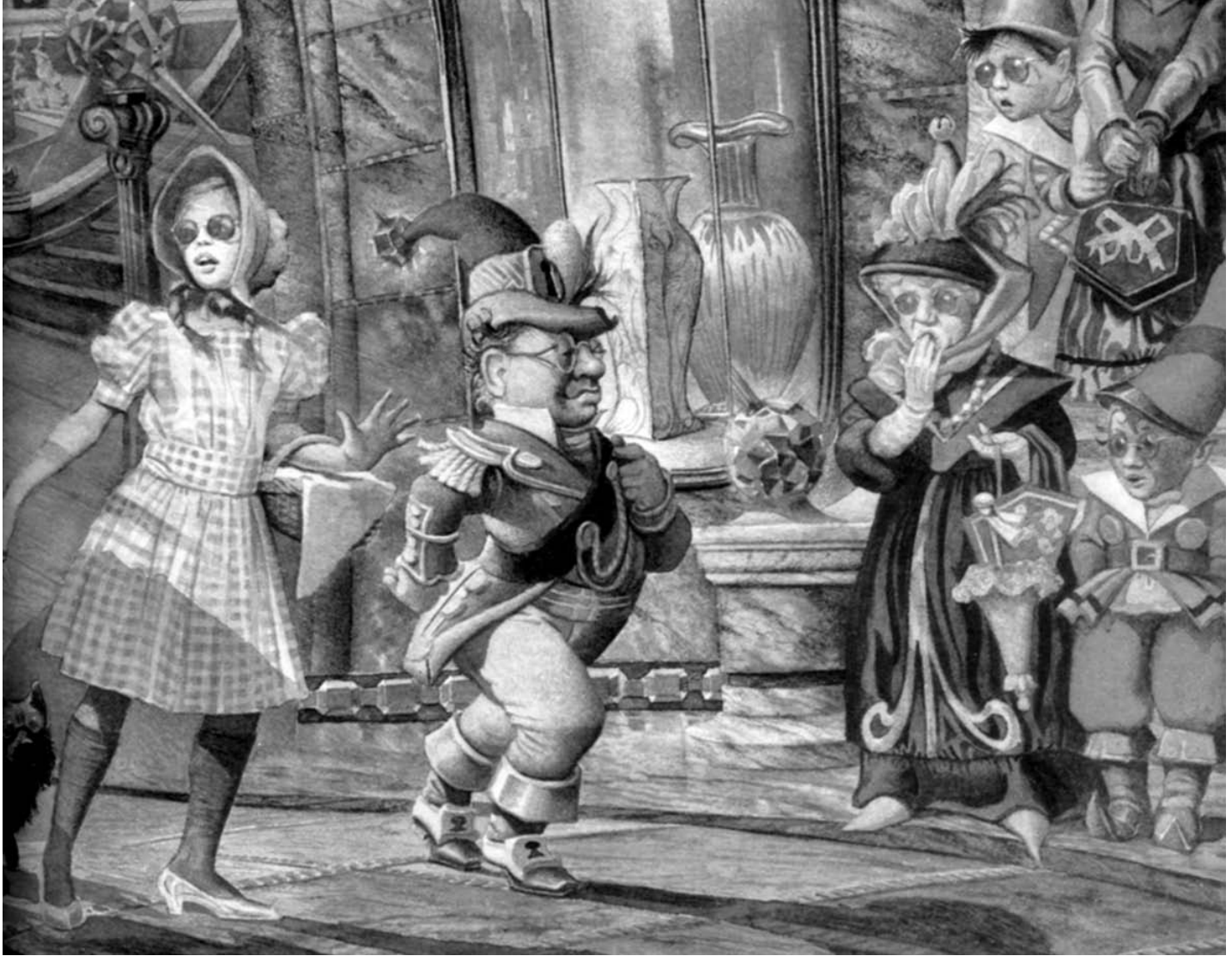
The City of Emeralds in The Wonderful Wizard of Oz is thought by some scholars to represent Washington, D.C. Everything is green in the Emerald City because green is the color of money. However, it turns out that the city is no greener than any other town; it is just that everyone in the city is forced to wear green spectacles (above), which make everything appear to be green, symbolizing the fact that in politics, nothing is as it appears.

ard, he sobs, “Whenever there is danger my heart begins to beat fast.” “Perhaps you have heart disease,” suggests Tin Woodsman, who always worries about hearts. But the Lion desires only courage and so he joins the party to ask help from the Wizard of Oz himself (65-72).