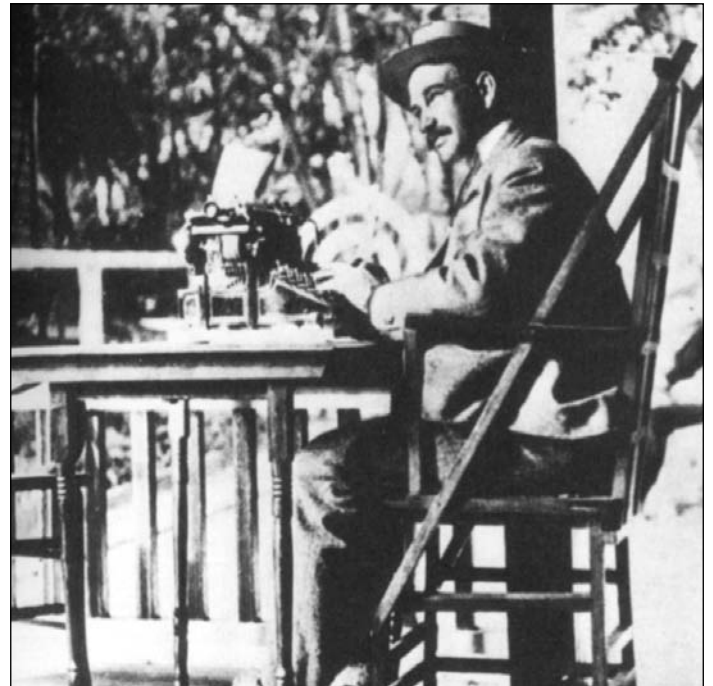
Above, Oz series author L. Frank Baum at work.

The Wizard of Oz is an entity unto itself, however, and was not originally written with a sequel in mind. Baum informed his readers in 1904 that he has produced The Marvelous Land of Oz reluctantly and only in answer to well over a thousand letters demanding that he create another Oz tale. 3 His original effort remains unique and to