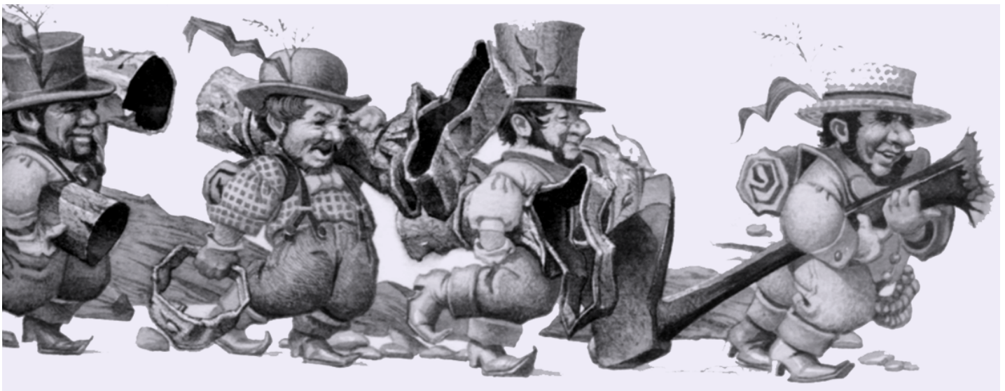
The enslavement of the yellow Winkies in The Wonderful Wizard of Oz was a not very well disguised reference to McKinley's decision to deny immediate independence to the Philippines after the Spanish-American War.

The Wizard's deception is of long standing in Oz and even the Witches were taken in. How was it accomplished? "It was a great mistake my ever letting you into the Throne Room," the Wizard complains. "Usually I will not see even my subjects, and so they believe I am something terrible" (185). What a wonderful lesson for youngsters of the decade when Benjamin Harrison, Grover Cleveland and William McKinley were hiding in the White House. Formerly the Wizard was a mimic, a ventriloquist and a circus balloonist. The latter trade involved going "up in a balloon on circus day, so as to draw a crowd of people together and get them to pay to see the circus" (186-187). Such skills are as admirably adapted to success in late-nine-